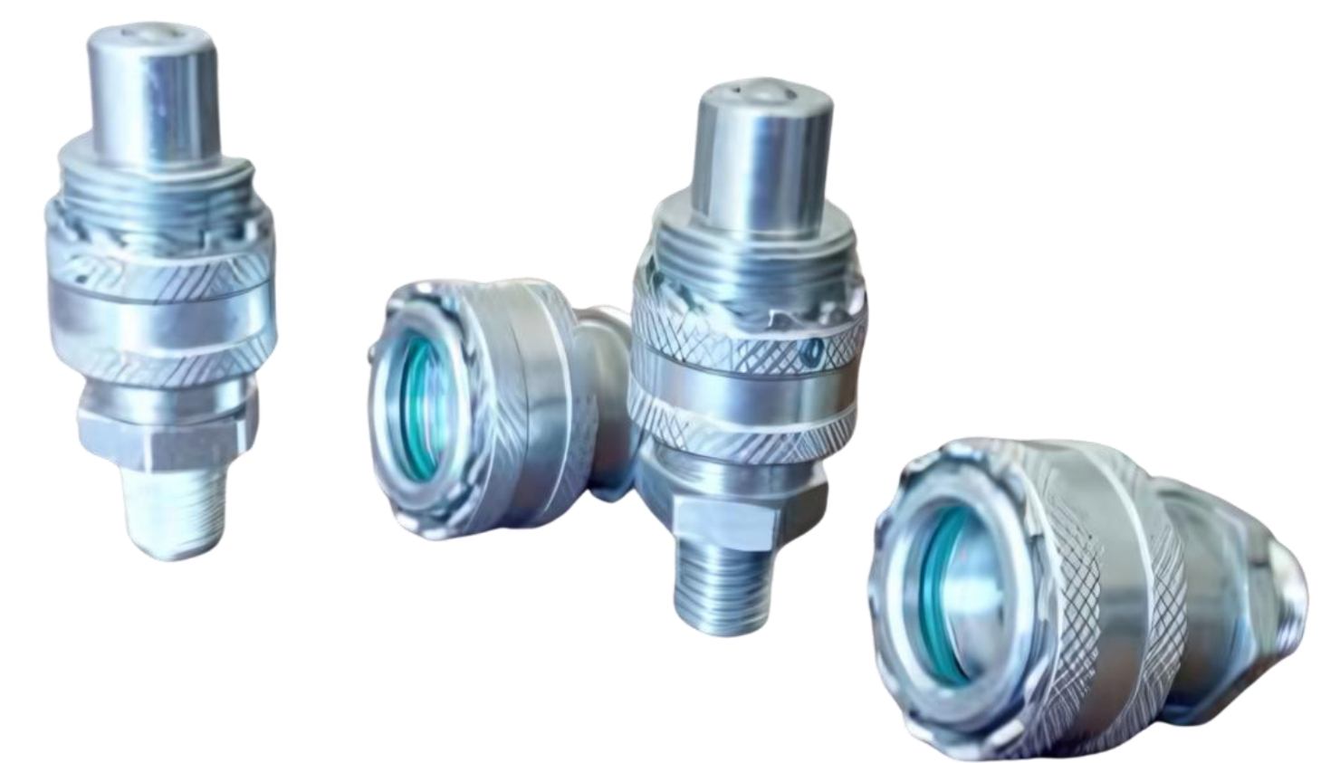
C Series Quick Coupler Dimension